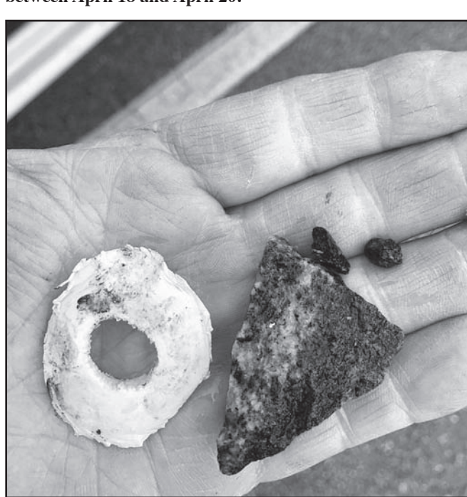
Regular flushing is important in order to clear debris that may collect in the water lines leading to the city's hydrants.

Fire Corps several years ago, she had to raise funds to replace the pump in one of the county's firetrucks.