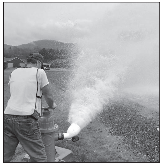
The City of Hiawassee flushed its 201 hydrants last month between April 18 and April 20.