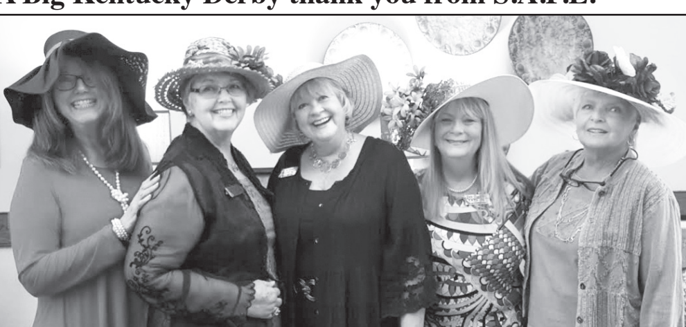
Kentucky Derby Party for S.A.F.E. participants

S.A.F.E. would like to extend a great big thank you to all who participated in the 2nd annual Kentucky Derby Party. Despite the torrential downpour outside it was all bright skies in the Union County Community Center! From the silent auction, our "prettiest hat contest," the delicious food provided by Amazing Grace Catering and awesome music by "Rewind", it was a wonderful evening with the 2 minutes of the Kentucky Derby race as the finale! We thank all those who participated and gave of their time and energy, those who donated items and those who came out and set up and cleaned up. So much goes into planning and preparing and "making it happen". We could not have done this without you all. We want to say thank you again for your support during this event and all you do all year long! S.A.F.E. appreci-